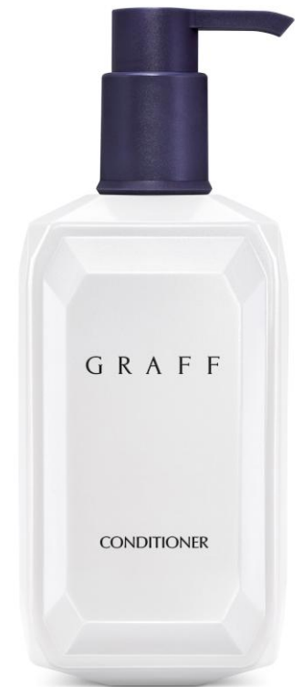
Conditioner 360 ml JGR56363B