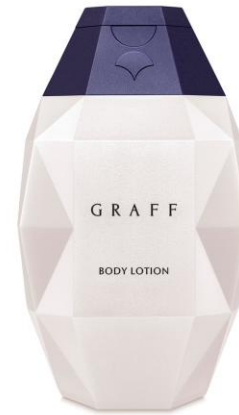
Body Lotion 50 ml 55313