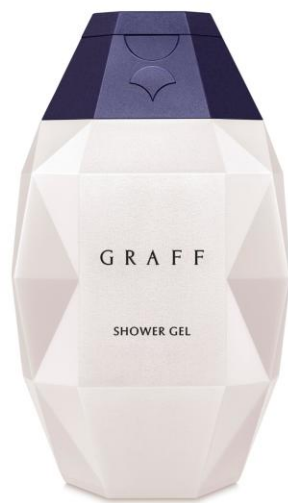
Shower Gel 100 ml 55322