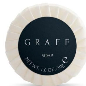
Soap 30 gr 55315