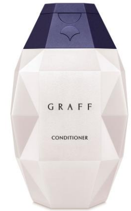
Conditioner 50 ml 55314