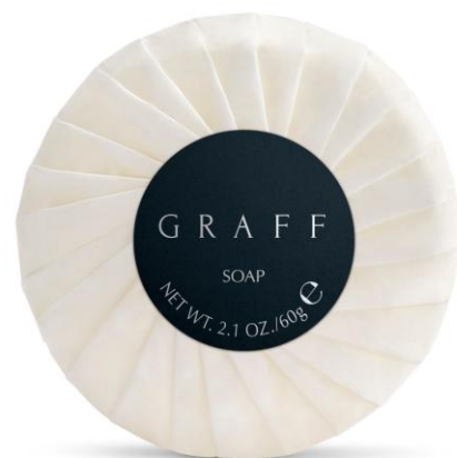
Soap 60 gr 55325