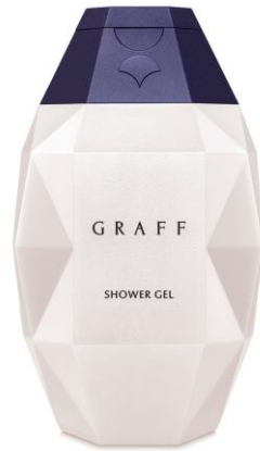
Shower Gel 50 ml 55312