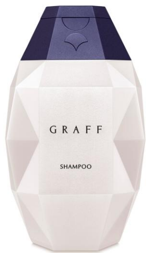
Shampoo 100 ml 55321