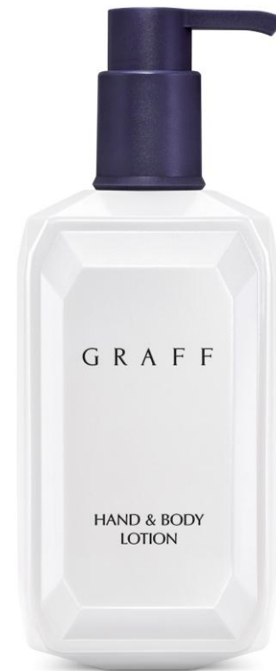
Hand & Body lotion 360 ml JGR56362B