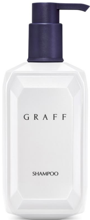
Shampoo 360 ml JGR56360B