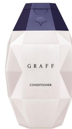
Conditioner 100 ml 55324