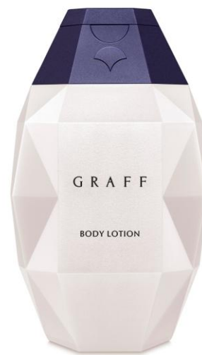
Body Lotion 100 ml 55323