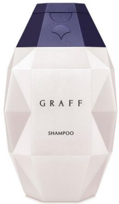
Shampoo 50 ml 55311